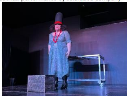
B2B with Apulian Companies and Albanian guests at Teatro Fantàsia