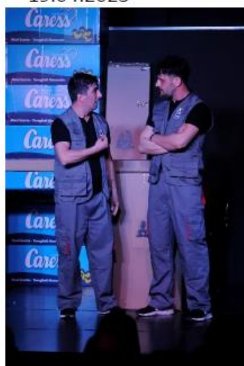
B2B with Teatro Fantasia - Spedizioni Don Chisciotte - theatrical performance by Teatro Fantasia